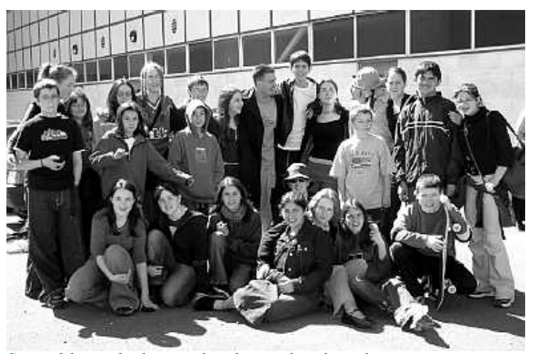
Some of the youth who contributed so much to the gathering.