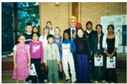
The Barnet Community WCP prizewinners with their certificates

Some of the many participants in the WCP in the City Montessori School