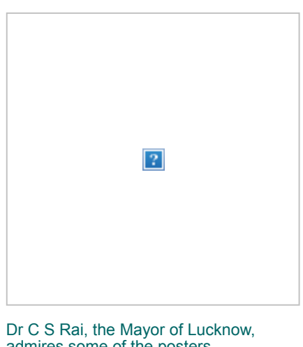
admires some of the posters

IT IS relatively easy to observe that the human body is but an evidence of the animating principle of "Unity in Diversity". Consider how when the human body begins to a perform a task, each member of the body is unified and coordinated in action by the brain, yet diversified in capacity and function so as to help it complete the task. The suspension of stars and planets in the vast empty space is yet another evidence of the principle of "Unity in Diversity". For it is the diversity of gravitational forces from each planet on the others, in an orderly way as commented on by Einstein himself, that sustains the continuous motion of each planet. Every breath of fresh air each and every one of us breathes is also a sign of the principle of "Unity in Diversity". For without the diversity of natural forces air would not have circulated through the Earth's atmosphere reaching us. In just the same way every drop of water we drink or use has travelled thousands of miles circulating the Earth, cleansing and at the same time unifying the human family with all other created things.