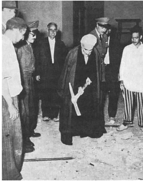
Falsafi participating in the destruction of Tehran's Baha'i Center

From the pulpit, Muhammad-Taqi Falsafi never hesitated to spread every manner of false and vicious rumor, intended to provoke the simple-minded, fanatical, and superstitious people against the Baha'is. He used the well-trained techniques of such preachers 148 and made up false stories, saying: