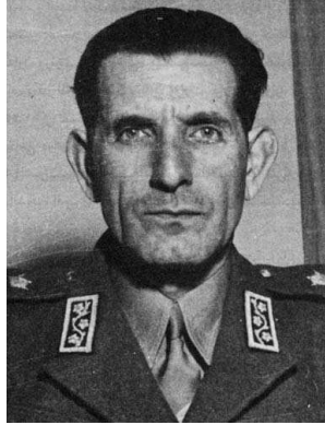
Lieutenant-General Haji 'Ali Razmara

Two significant incidents marked Razmara's premiership. First, through trustworthy officers, he arranged for ten leaders of the Tudeh Party who had been incarcerated in Qasr Prison to escape. Through this deed, he endeared himself to the leadership of the Soviet Union. Second, through his opposition to the nationalization of the petroleum industry, he won the deep gratitude of English imperialism. It should be noted that the Tudeh Party was among the staunchest supporters of Razmara during his tenure as prime minister.