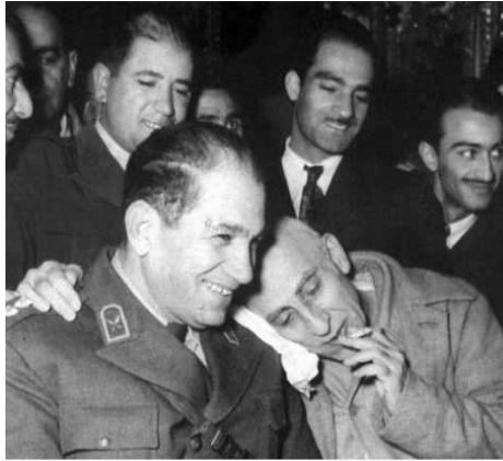
Dr. Muhammad Musaddiq and Colonel Shahquli in the military tribunal

When his case was appealed, I was appointed by him to be his lawyer, and for outward appearances he would uphold the lawyer-client relationship. 57