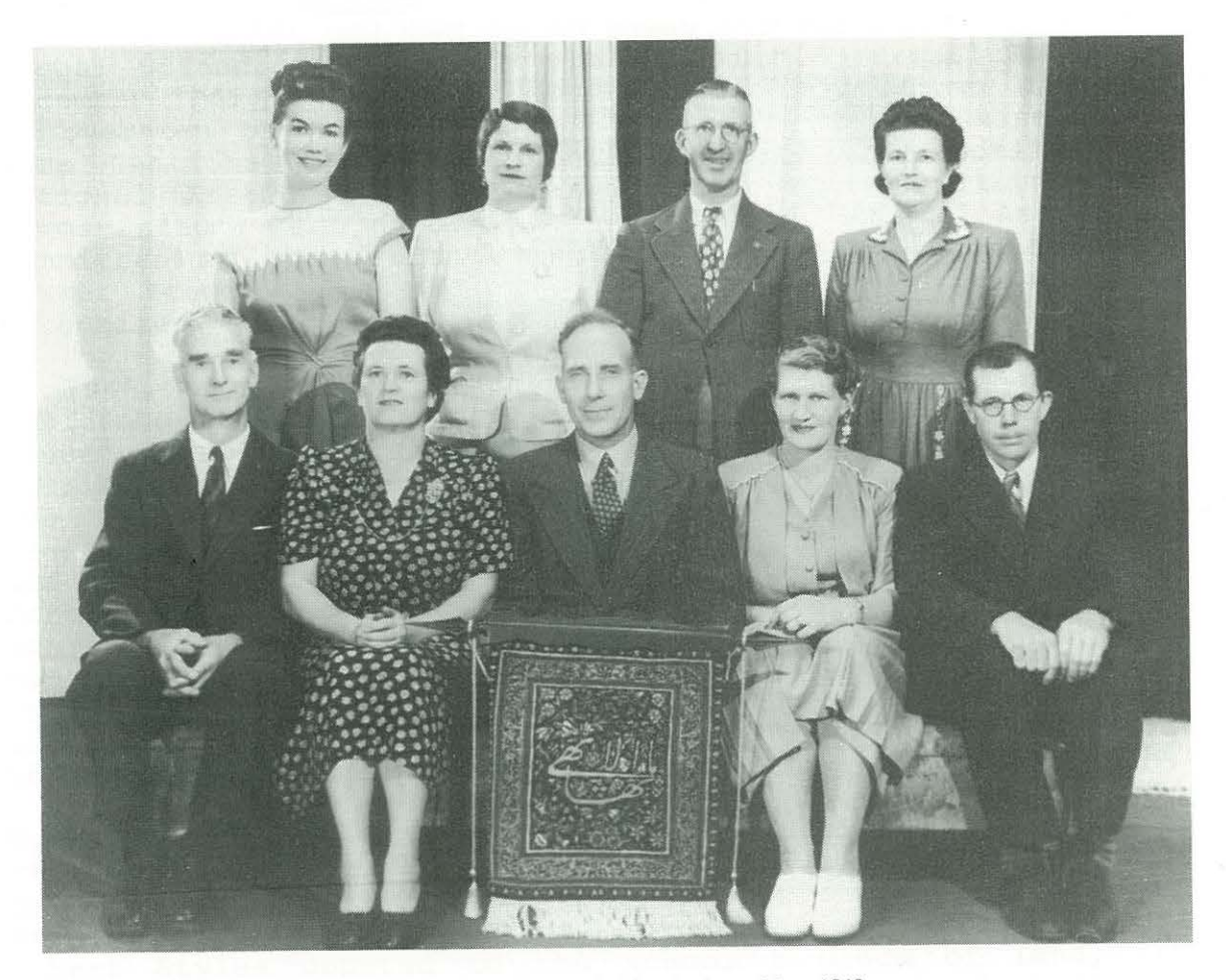
1st Yerrinbool Local Spiritual Assembly. 1948