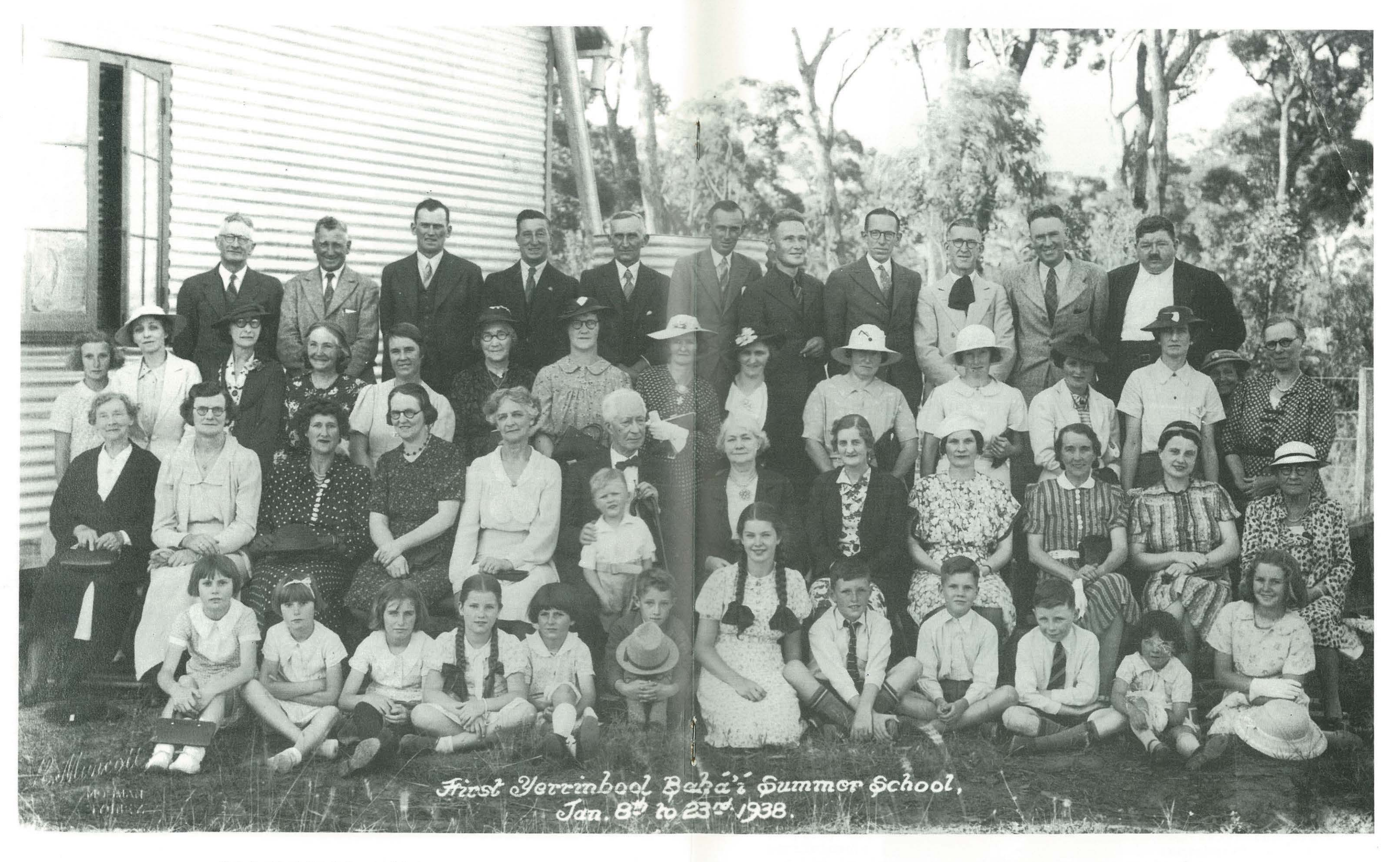
First Yerrinbool Baha'i Summer School