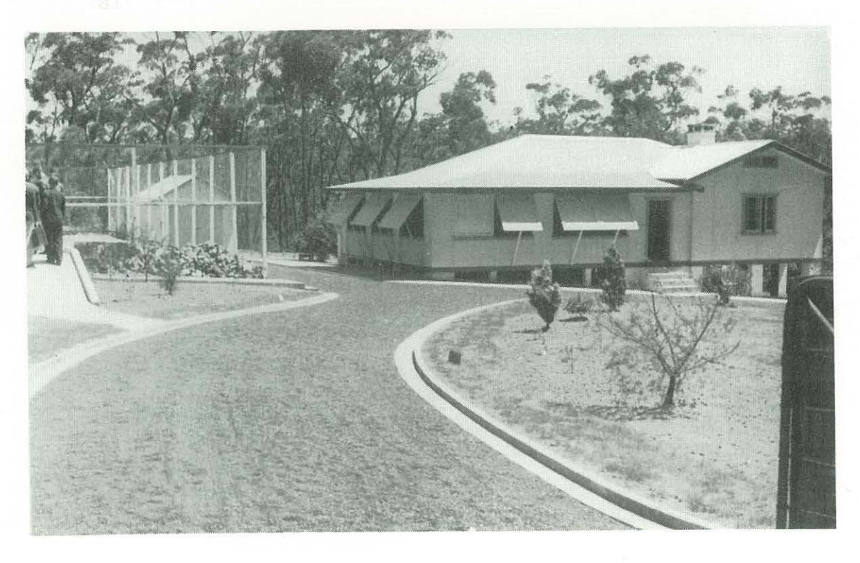
View of Residence, 1943