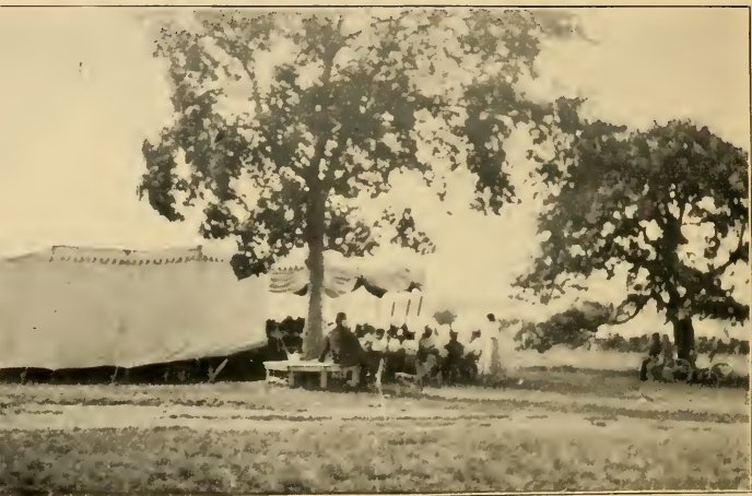
THE GREAT TENT.