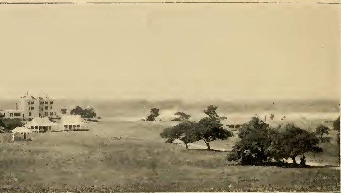
A GLIMPSE OF GREENACRE.