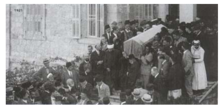
Funeral procession leaving 'Abdu'l-Bahá's home.

Horace Holley, an American who met 'Abdu'I-Bahá in Switzerland, felt the spirit that emanated from Him. "I yielded to a feeling of reverence," Holley writes, "which contained more than the solution of intellectual or moral problems. To look upon so wonderful a human being, to respond utterly to the charm of His presence—this brought me continual happiness. . . . Patriarchal, majestic, strong, yet infinitely kind, he appeared like some just king that very moment descended from his throne to mingle with a devoted people."<sup>25</sup>