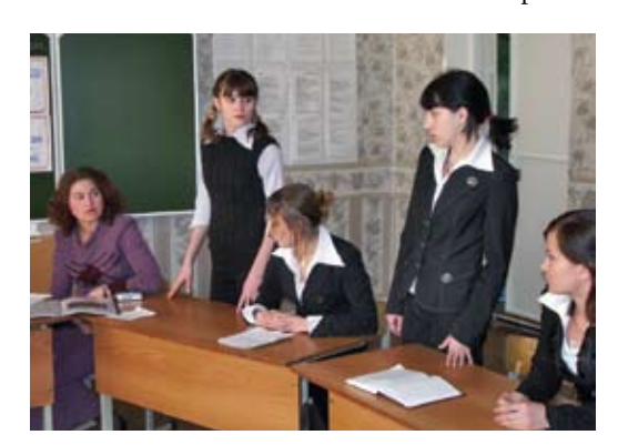
Golden Way Program, Russia

Through its Golden Way (Altyn Iul) Program for Social Competence and Ethical Decision Making, the Association for Creative Moral Education (ACME) in Russia works to introduce moral education lessons into schools in the Republic