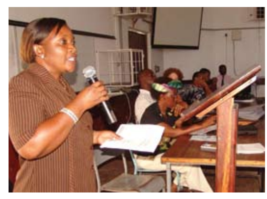
Dar es Salaam, Tanzania

N ORDER TO RAISE awareness among her peers about gender equality and violence against women, a Bahá'í youth from Gloucestershire, United Kingdom, holds biweekly meetings during lunch at her high school to discuss issues such as domestic violence, unequal pay rates, and trafficking in women and girls.