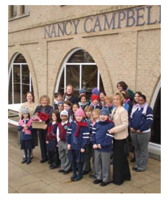
Nancy Campbell Collegiate Institute, Canada

Schools reach some 1,100 students from nursery to secondary level. Students enrolled in the program aimed at the spiritual empowerment of junior youth participate in such service activities as planting trees in the neighborhood, looking after the children in the nursery, and visiting and assisting orphanages in the community. In neighboring Tanzania, the Ruaha Secondary School is providing instruction for grades 8 to 11, giving particular attention to the education of girls. In 2006, Ruaha began to offer a teacher-training program to a network of Bahá'í preschools in Tanzania in order to assist in meeting the educational needs of the country.