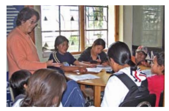
Junior youth being interviewed on Radio Bahá'í Ecuador

Meanwhile, Bahá'í-operated radio stations in Latin America and Asia provide a notable example of the role that media can play in contributing to the material and spiritual progress of society. Radio Bahá'í Ecuador, for instance, has served the Quechua- and Spanish-speaking inhabitants of the rural province of Imbabura and Pichincha and the urban areas of Otavalo and Cayambe since it began broadcasting in December 1977. The station promotes education, development, and community service through programs that nurture moral values and emphasize indigenous culture.