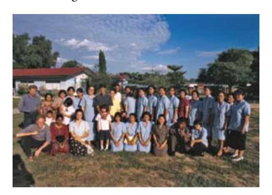
Santitham Vidhayakhom School, Thailand

In Lilongwe, Malawi, the Bambino Private