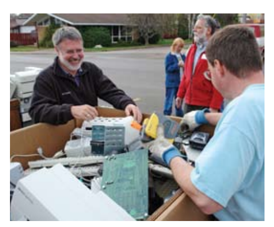
Michigan, United States

N AN EFFORT TO eliminate hazardous waste and to contribute to protecting the environment, Bahá'ís in Michigan in the United States participate in an annual Earth Clean Sweep in which 300 tons of "e-waste"—unwanted electronic equipment such as old television sets, computers, and VCRs—are collected and recycled.