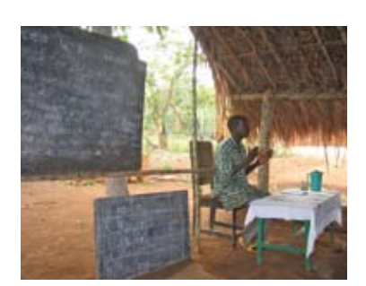
Ecole Saint André, Central African Republic

In the Philippines, the Dawnbreakers Foundation is applying the learning it has gained during its many years of experience supporting tutorial schools in order to systematically assist eight community schools in three regions in the country. The Foundation plans to further nurture the growth of community schools by establishing a regular program of teacher training, which is to be offered to existing teachers as well as those preparing to be teachers. In India, the promotion of village schools in the home communities of graduates of its Teacher Training Center is one of the major lines of action carried out by the New Era Foundation.