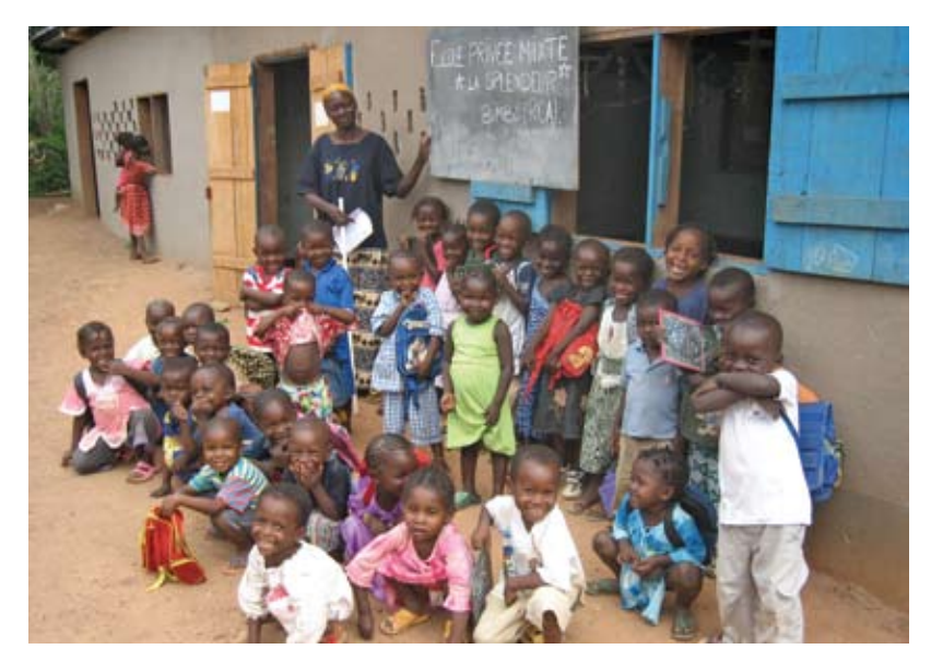
Ecole Mixte "La Splendeur", Central African Republic