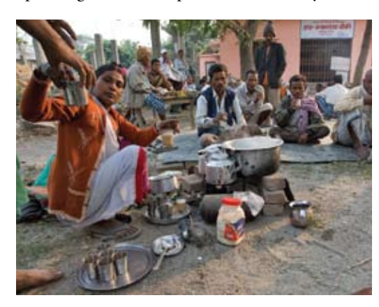
A small business in Nepal

in 2002 with five banks in the Morang district of Nepal and has since grown to include 60 banks operating in different parts of the country.