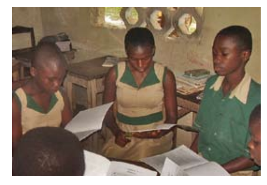
The Olinga Foundation for Human Development, Ghana

The Uganda Program of Literacy for Transformation (UPLIFT), to take another example, is working with illiterate adults, mainly women. Its program stresses the necessity of promoting the equality of women and men and the importance of establishing proper relationships among family members. Materials discuss topics such as