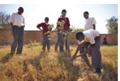
Bambino Private Schools, Malawi

Schools reach some 1,100 students from nursery to secondary level. Students enrolled in the program aimed at the spiritual empowerment of junior youth participate in such service activities as planting trees in the neighborhood, looking after the children in the nursery, and visiting and assisting orphanages in the community. In neighboring Tanzania, the Ruaha Secondary School is providing instruction for grades 8 to 11, giving particular attention to the education of girls. In 2006, Ruaha began to offer a teacher-training program to a network of Bahá'í preschools in Tanzania in order to assist in meeting the educational needs of the country.