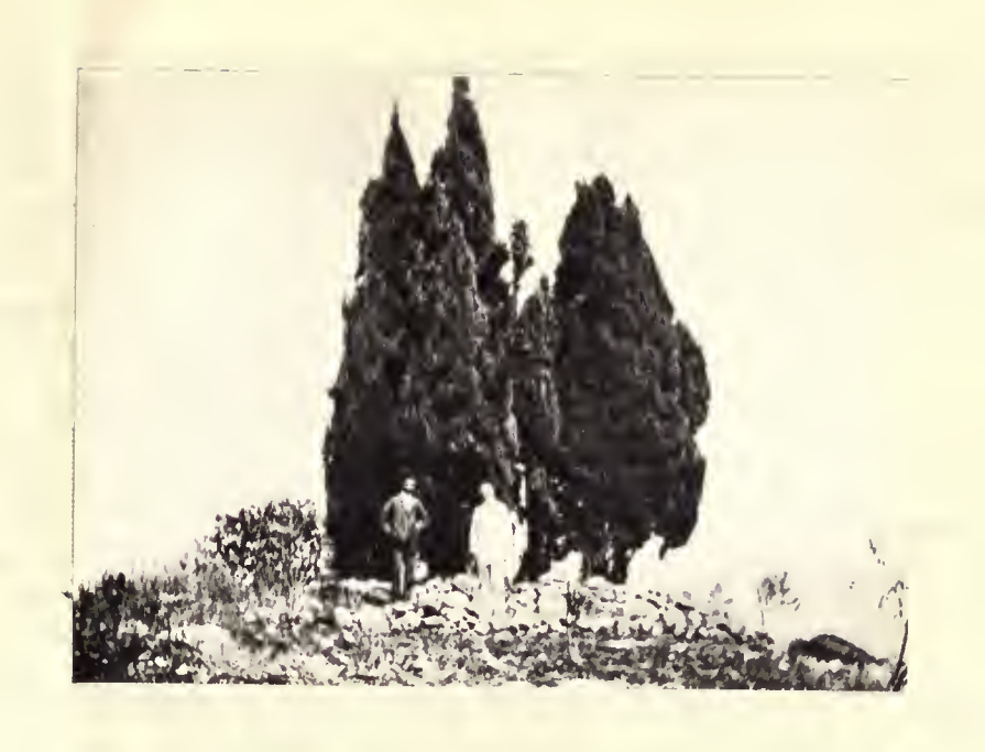
CLUMP OF CYPRESS TREES NEAR THE TOMB OF BAB WITHIN THE SHADE OF WHICH THE BAHA O'LLAH USED TO SIT