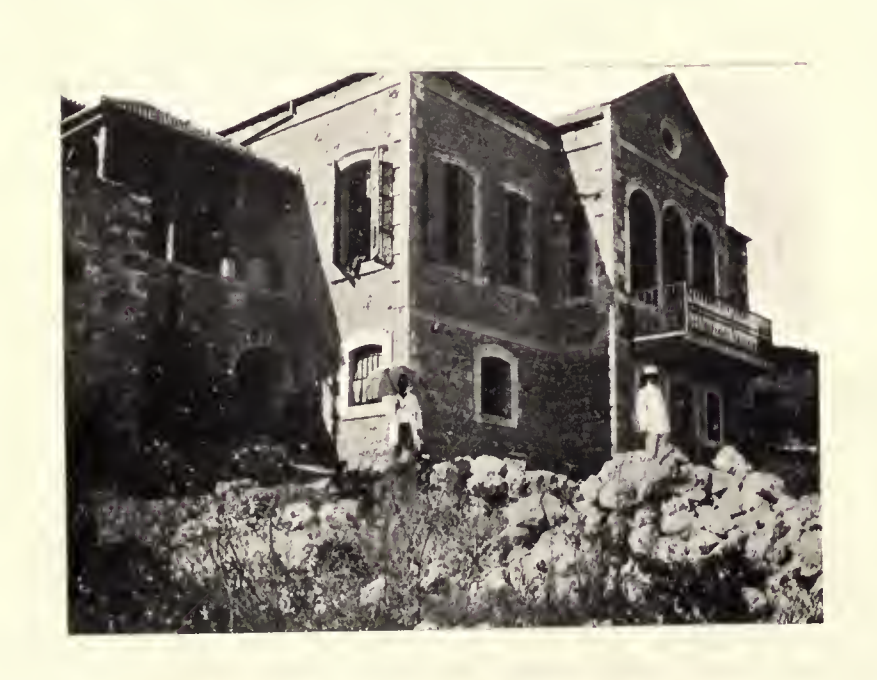
NORTH FRONT OF THE MOZAFER KHANEH