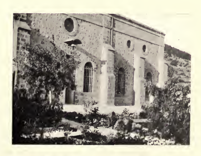
NORTH FRONT OF THE TOMB OF THE BAB