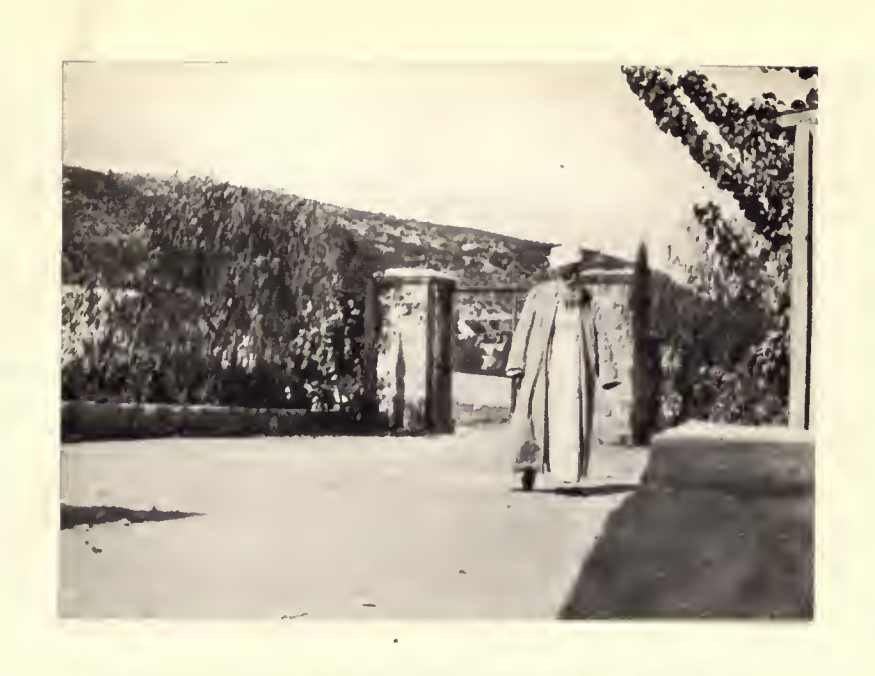
ABDUL BAHA ENTERING THE GARDEN OF HIS HOUSE IN HAIFA