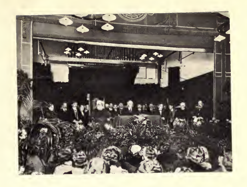
ABDUL BAHA IN A MEETING OF BAHAIS IN LONDON