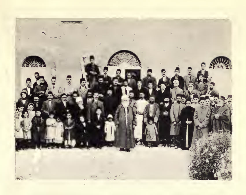
ABDUL BAHA AND A GROUP OF BELIEVERS AT THE TOMB OF THE BAB