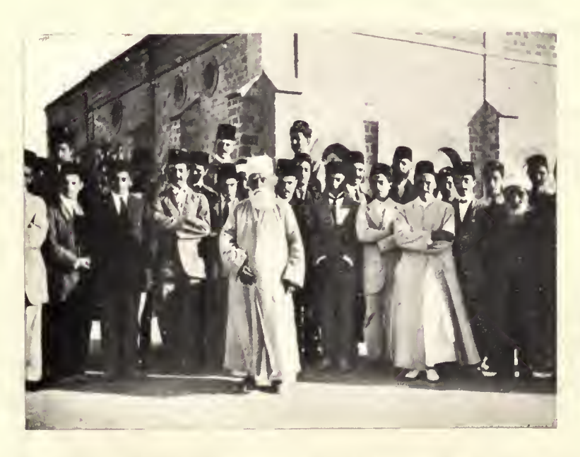
ABDUL BAHA AND A GROUP OF BAHAIS AT THE TOMB OF THE BAB