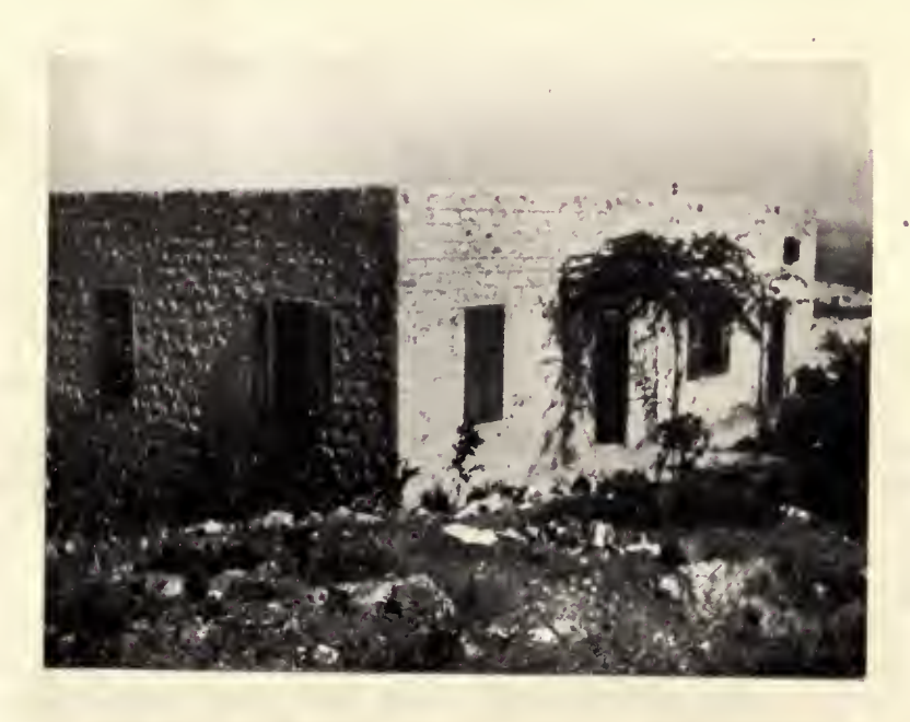
THE HOUSE WHERE ABDUL BAHA OFTEN STAYS ON THE SLOPE OF MOUNT CARMEL