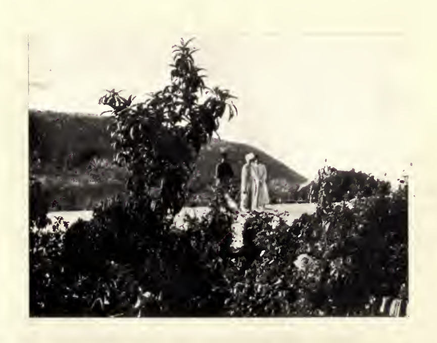
ABDUL BAHA WALKING ON THE TERRACE BEFORE THE TOMB OF THE BAB—THE PROMONTORY OF MOUNT CARMEL IS IN THE DISTANCE