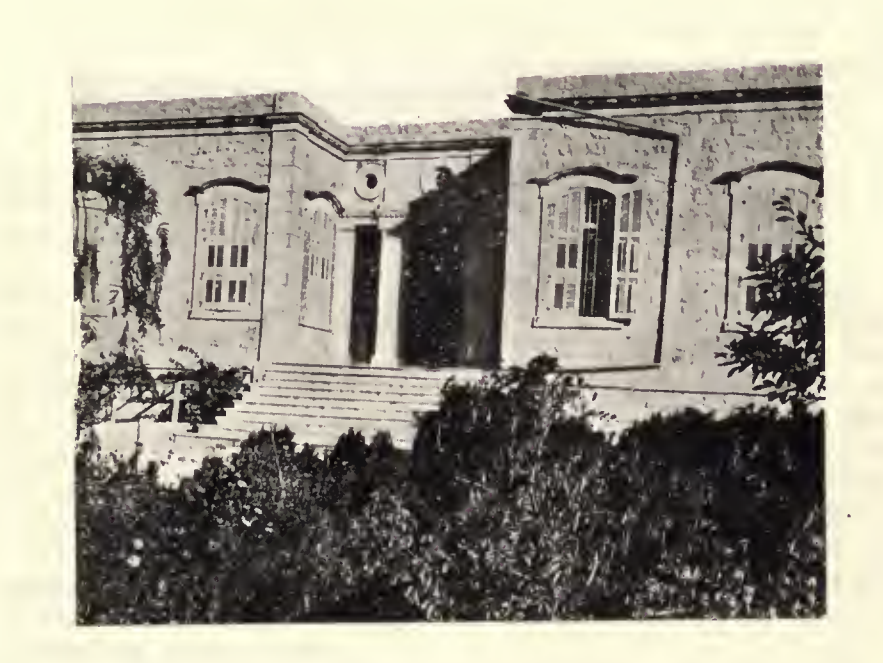
ABDUL BAHA'S HOUSE IN HAIFA