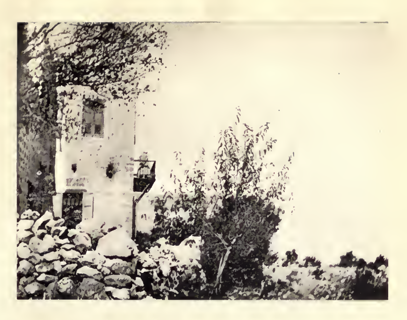
ABDUL BAHA ON THE BALCONY OF THE HOUSE ON MOUNT CARMEL