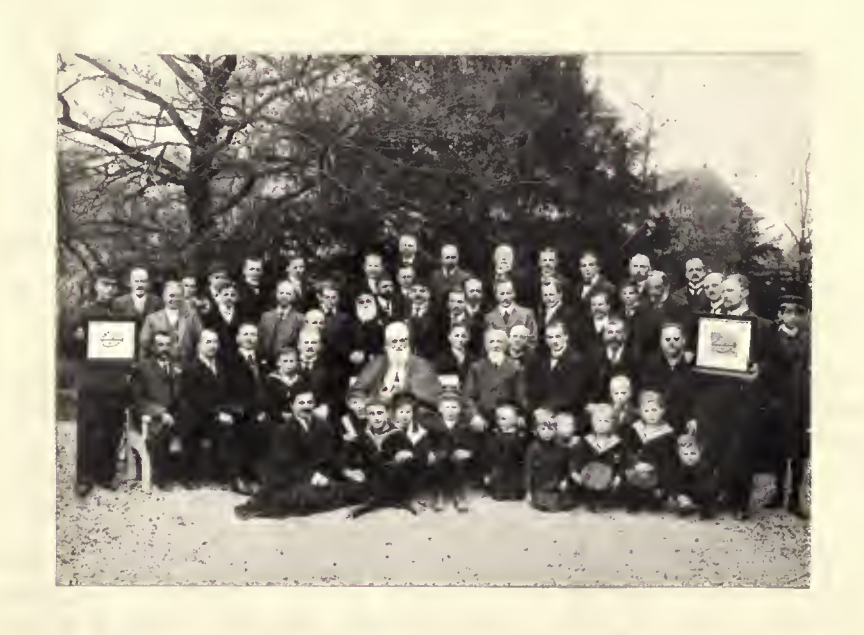
ABDUL BAHA WITH SOME OTHER EAHAIS IN STUTTGART