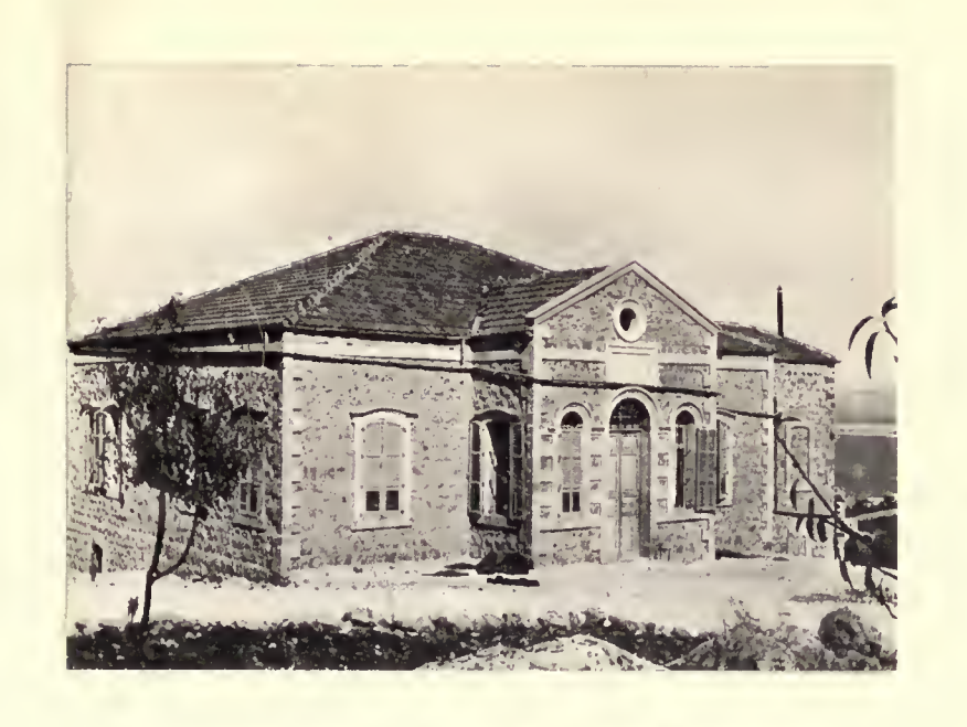
SOUTH FRONT OF THE MOZAFER KHANEH