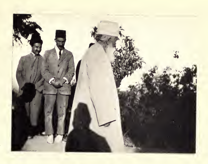
ABDUL BAHA WITH SOME YOUNG MEN ON MOUNT CARMEL