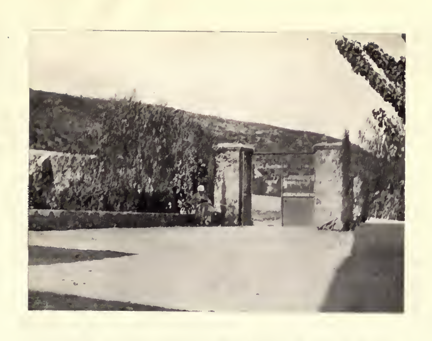
ABDUL BAHA SEATED WRITING WITHIN THE GATEWAY OF HIS HOME IN HAIFA