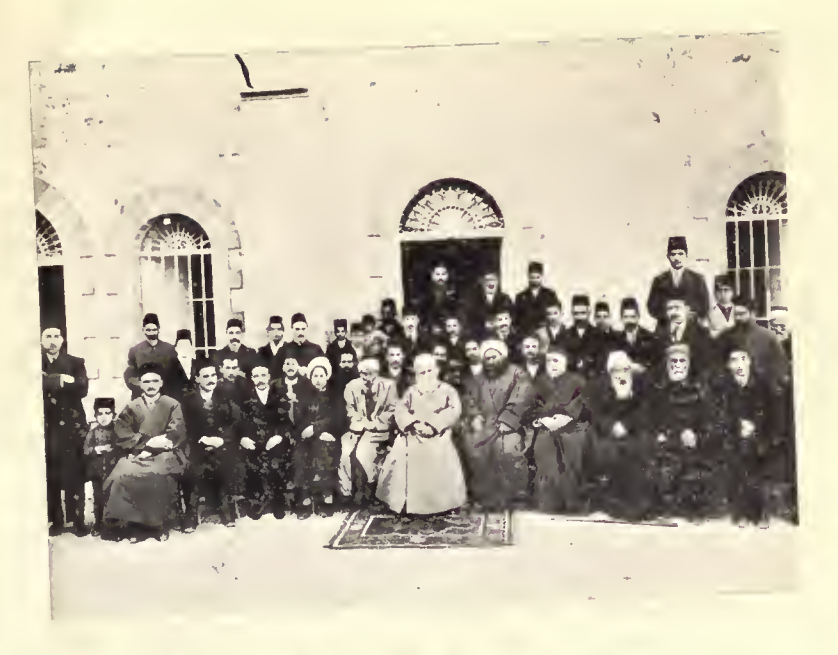
ABDUL BAHA WITH A GROUP OF BAHAIS AT THE TOMB OF THE BAB