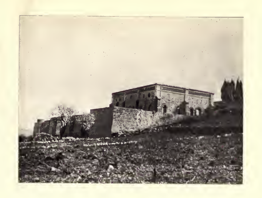
TOMB OF THE BAE ON MOUNT CARMEL