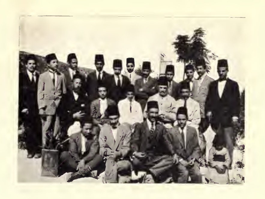
BAHAI STUDENTS ON MOUNT CARMEL