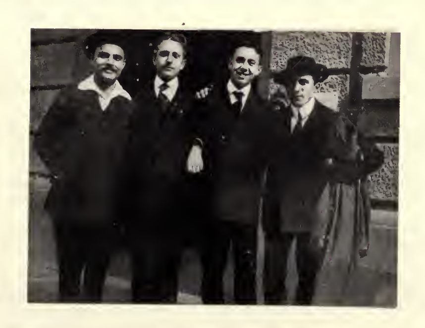
FOUR YOUNG BAHAIS OF ESSLINGEN