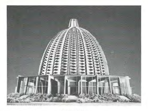
EUROPE Frankfurt, Germany