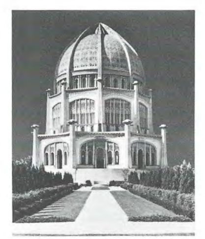
NORTH AMERICA Wilmette, Ill.