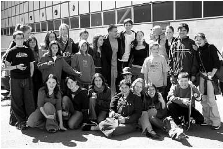
Some of the youth who contributed so much to the gathering.