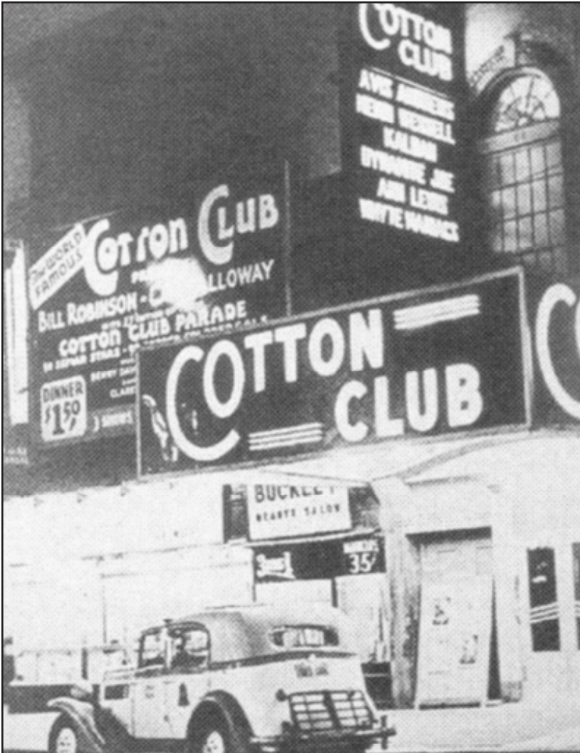
THE HARLEM RENAISSANCE, 1925-1934 brought African-American music, dance, artistic and literary achievement into the mainstream of American culture.