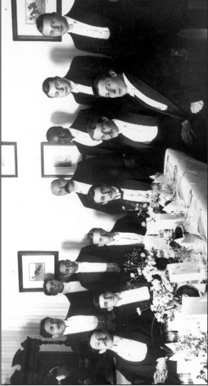
ALAIN LOCKE WITH THE OXFORD COSMOPOLITAN CLUB comprised mainly of Oxford University students from Norway, Russia, Scotland, South Africa, and India.