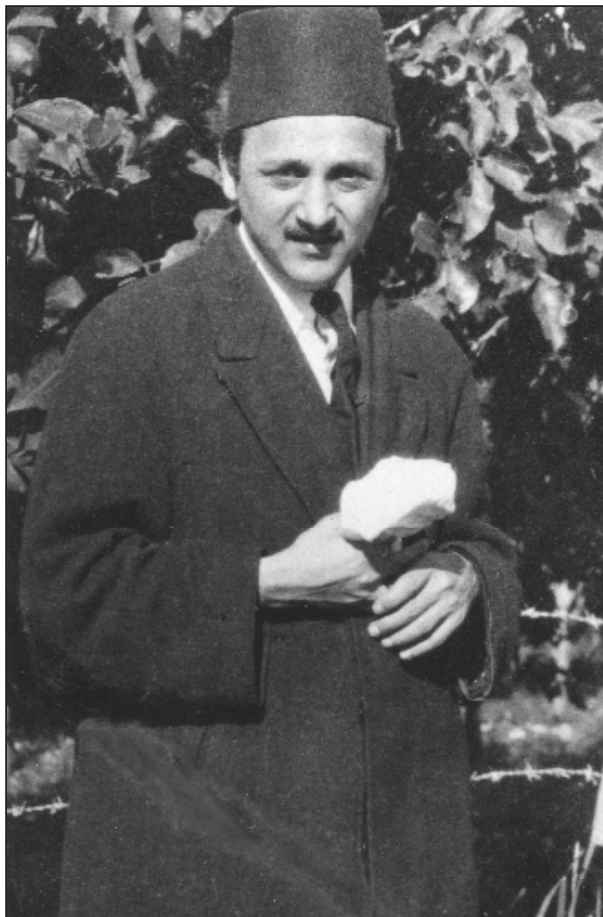
SHOGHI EFFENDI RABBANI