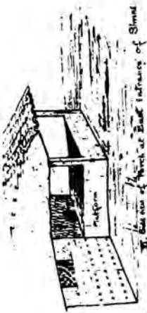
III. East view of Shrine at East entrance of Shrine