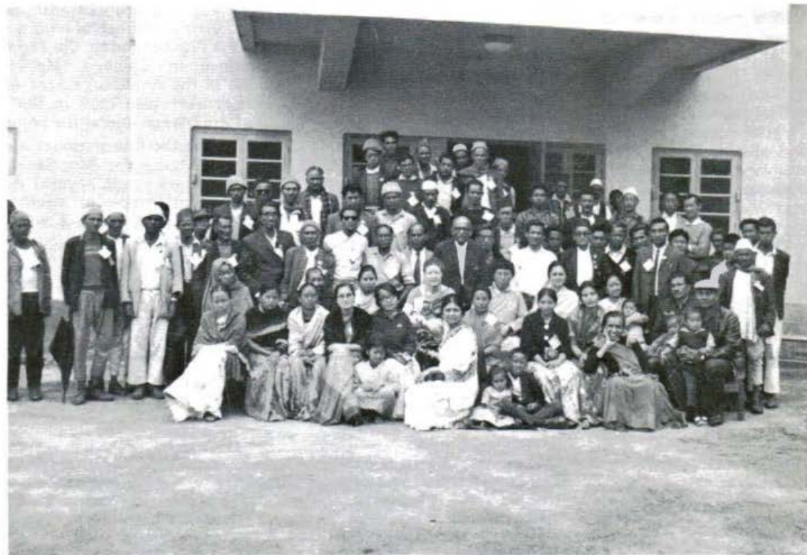
The historic first Bahá'í convention held in Gangtok, Sikkim, India, April 30 - May 2, 1967. 'Amatu'l-Bahá Rúhiyyih Khán um, special representative of the Universal House of Justice, is shown in second row, center.

On April 23 'Amatu'l-Bahá Rúhiyyih Khán um left the Holy Land for India in order to attend, as a special representative of the Universal House of Justice, the first Bahá'í Convention in Sikkim. On her way to Sikkim she stayed a few days in New Delhi to attend the Indian Convention.