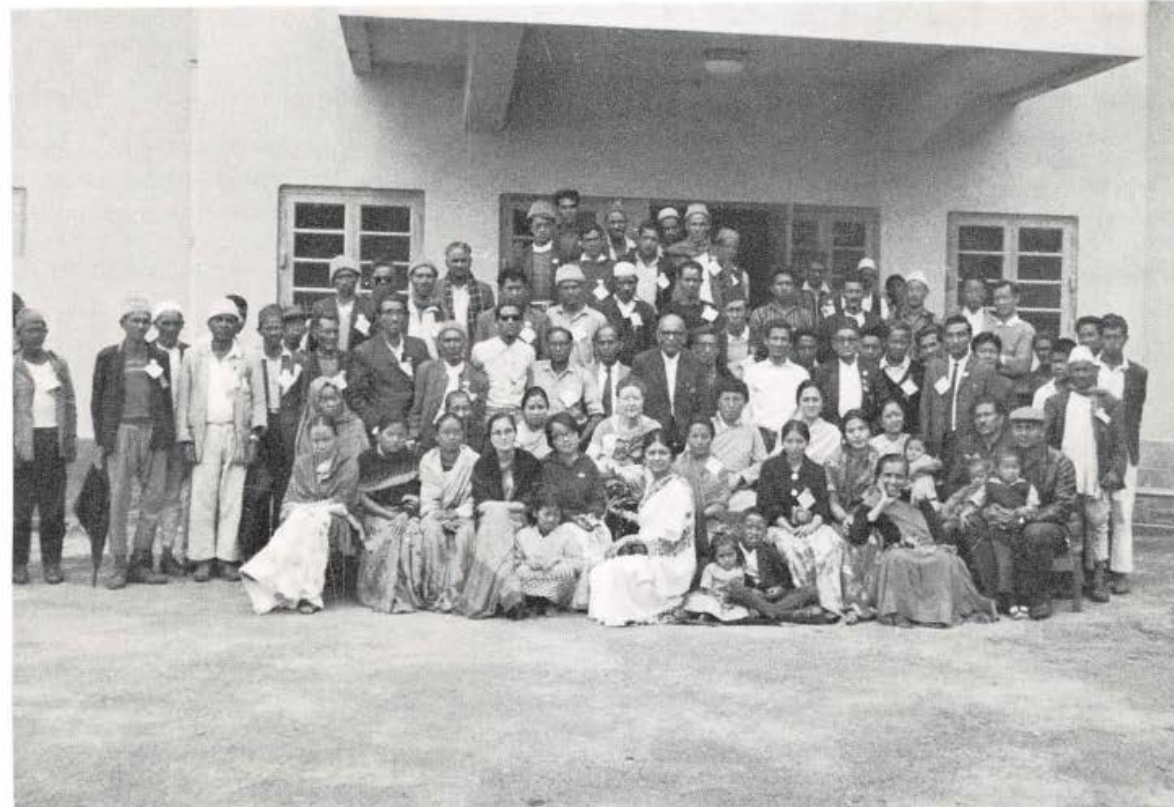
The historic first Bahá'í convention held in Gangtok, Sikkim, India, April 30 - May 2, 1967. 'Amatu'l-Bahá Rúḥíyyih Khán um, special representative of the Universal House of Justice, is shown in second row, center.

On April 23 'Amatu'l-Bahá Rúḥíyyih Khán um left the Holy Land for India in order to attend, as a special representative of the Universal House of Justice, the first Bahá'í Convention in Sikkim. On her way to Sikkim she stayed a few days in New Delhi to attend the Indian Convention.