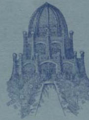
THE BAHAI TEMPLE

"The doors will be opened to all the nations and religions. There will be absolutely no line of demarcation drawn. Its charities will be dispensed irrespective of color or race. Its gates will be flung wide open to mankind; prejudice towards none, love for all." —Abdu'l-Baha