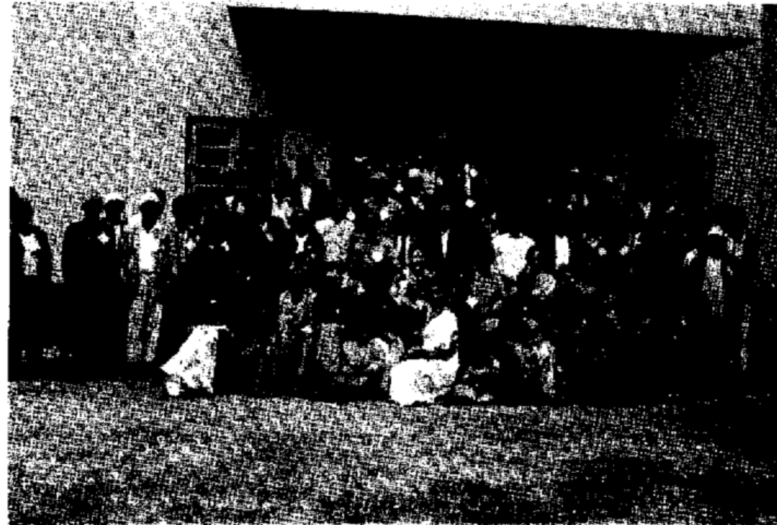
The historic first Bahá'í convention held in Gangtok, Sikkim, India, April 30 - May 2, 1967. 'Amatu'l-Bahá Rúhiyyih Khánum , special representative of the Universal House of Justice, is shown in second row, center.

On April 23 'Amatu'l-Bahá Rúhiyyih Khánum left the Holy Land for India in order to attend, as a special representative of the Universal House of Justice, the first Bahá'í Convention in Sikkim. On her way to Sikkim she stayed a few days in New Delhi to attend the Indian Convention.