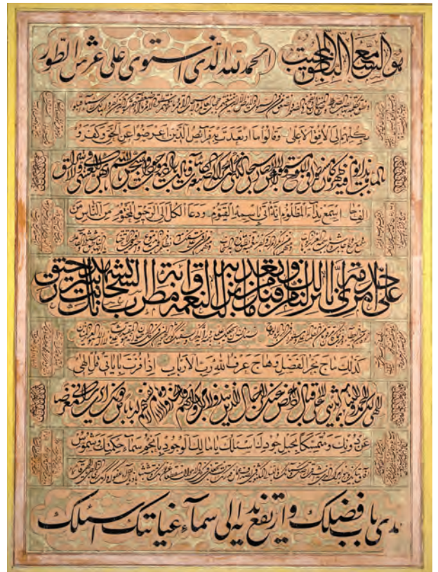
Figure 4: Calligraphy After Treatment.