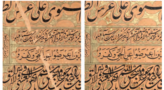
Figure 3: Close up of the skinned area before treatment (left) and after treatment (right).