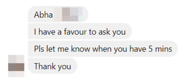
Figure 2: Usage of 'Abhá' by an Iranian Bahá'í as part of informal conversation

A phenomenon that should not go unnoticed is the colloquialization of certain distinctly Bahá'í terms. A prime example is the abbreviation of the greeting 'Alláh-u-Abhá' to just 'Abhá'. This usage seems to be popular chiefly among Iranian Bahá'ís, and it may in fact be exclusive to them. Since, however, Iranians have a considerable presence in most Bahá'í communities across the world, it is difficult to overlook behaviours and practices associated with their culture that are sometimes carried over into general Bahá'í culture.<sup>33</sup> Here are two examples of 'Abhá' in action, both taken from exchanges on Facebook Messenger: