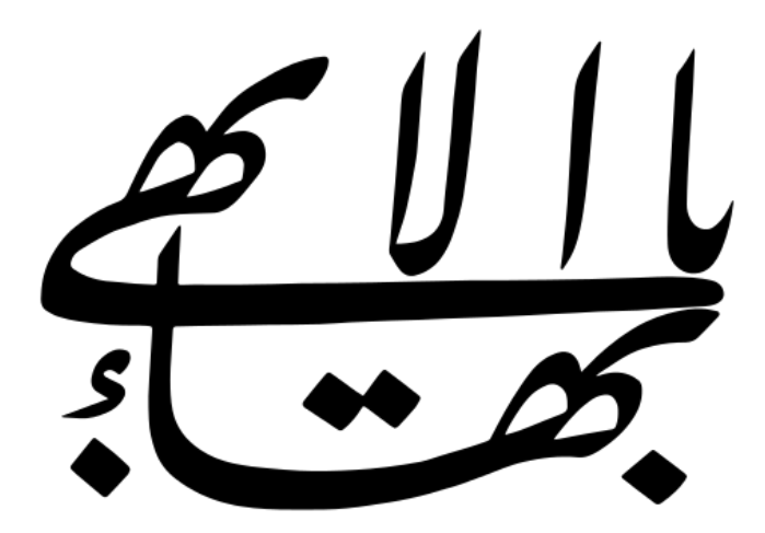
Figure 1: Mishkín-Qalám's iconic calligraphic rendering of the invocation Yá Bahá'u'l-Abhá Image produced by 'Parsa' of the Wikipedia community

Yá Bahá'u'l-Abhá also holds a special place in Bahá'í iconography through a calligraphic rendering of the invocation that was produced by Mírzá Ḥusayn-i-Iṣfahání (familiarly known as Mishkín-Qalam<sup>15</sup>), an early Bahá'í and one of Bahá'u'lláh's contemporaries. This iconic rendering of Yá Bahá'u'l-Abhá, pictured below, is typically framed and displayed prominently in Bahá'í homes and centres all across the world.