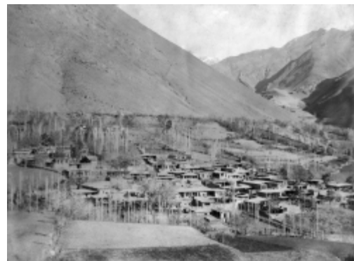
The village of Afchih, near Tehran, where Bahá'u'lláh was staying when a warrant was issued for His arrest and detention in 1852. Photo date: 1914.