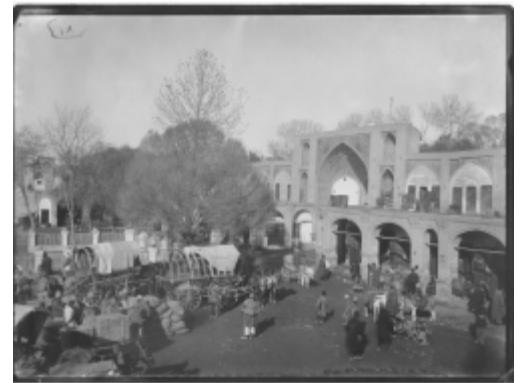
Courtyard in the bazaar of Tehran where many followers of the Báb and Bahá'u'lláh were executed.

Some of the most prominent Bábís spent time in Tehran or made short stopovers while passing through the city on their travels. When Táhirih (Fátimih Umm-Salamih, known also by the title Qurratu'l-Ayn ), one of the Báb's outstanding disciples (See: Letters of the Living ), was held captive in the city of Qazvin following the assassination of her uncle Hájí Mullá Muhammad Taqí on 25 October 1847, Bahá'u'lláh arranged for her to escape and to be sheltered in Tehran. Bahá'u'lláh's house appears to have been a focus for the Bábís; many well-known figures—including Vahíd (Siyyid Yahyá Dárábí), formerly an influential cleric with close ties to the shah—visited or stayed there.