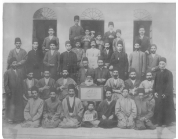
Gathering of Bahá'í men and boys in Tehran.