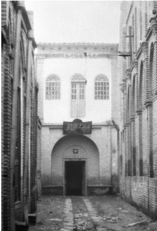
Historic photograph of the entrance to the House of Mirzá 'Abbás Núrí (Mirzá Buzurg, the father of Bahá'u'lláh) in Tehran, Iran.