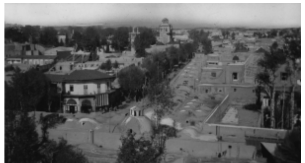
A view of the city of Tehran, where Bahá'u'lláh was imprisoned in 1852. Date: c. 1930.

The Bahá'í sacred writings include numerous references to Tehran as a place of special import and as the birthplace of a Manifestation of God. In His book the Qayyúmu'l-Asmá' the Báb refers to Tehran as "the Sacred Land." 4 Bahá'u'lláh apostrophizes Tehran in many of His writings, conveying a great fondness for His native city, which He describes as "the Abode of supreme blissfulness" and "the holy and shining city." 5 Following His frequent practice of representing place names by referring to their initial letter in the Persian alphabet, He frequently calls Tehran the "Land of Tá." In the Kitáb-i-Aqdas (Most Holy Book), Bahá'u'lláh refers to the city of Tehran, saying, "Rejoice with great joy, for God hath made thee 'the Dayspring of His light', inasmuch as within thee was born the Manifestation of His Glory." 6 He also calls Tehran the "mother of the World" 7 and "the city in which the sweet savors of reunion have breathed." 8 "In thee," He states,