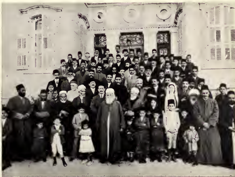
ABDUL BAHA WITH A GROUP OF BAHAIS AT HIS HOME IN HAIFA