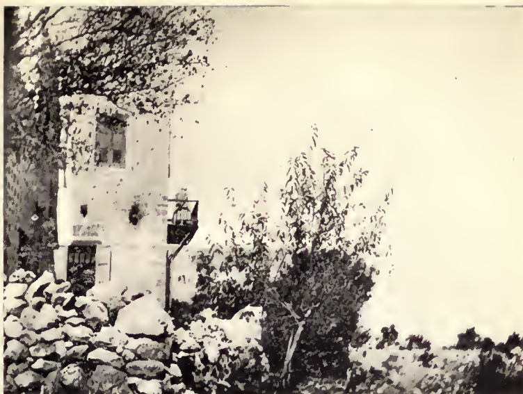
ABDUL BAHA ON THE BALCONY OF THE HOUSE ON MOUNT CARMEL