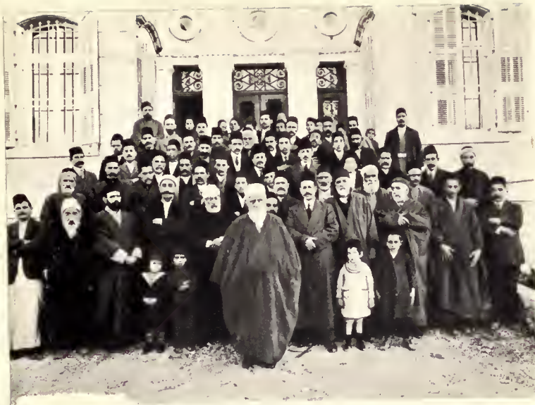
ABDUL BAHÁ WITH SOME OF HIS ORIENTAL FRIENDS AT HIS HOME IN HAIFA