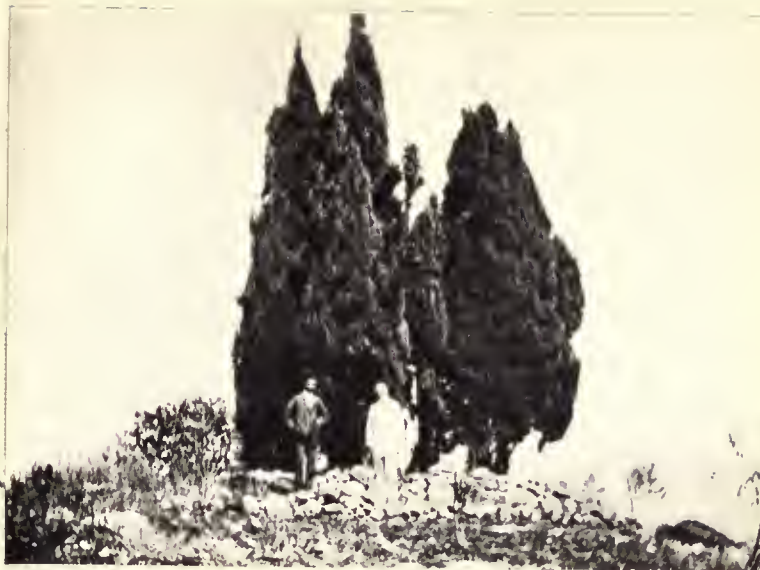
CLUMP OF CYPRESS TREES NEAR THE TOMB OF BAB WITHIN THE SHADE OF WHICH THE BAHÁ'Í O'LLAH USED TO SIT