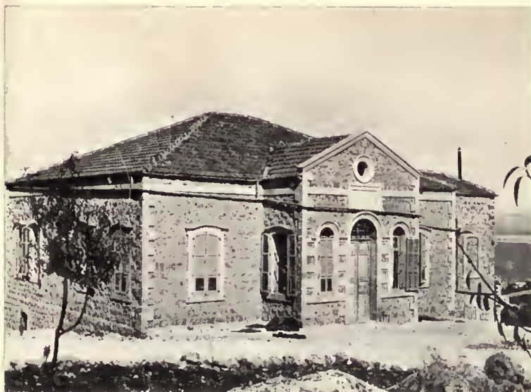
SOUTH FRONT OF THE MOZAFER KHANEH