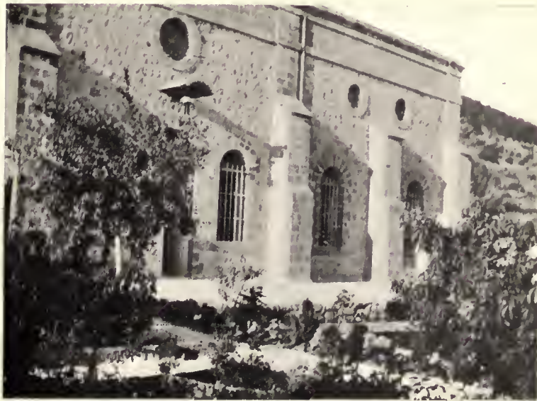
NORTH FRONT OF THE TOMB OF THE BAB