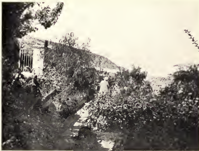
ABDUL BAHA WALKING IN HIS GARDEN IN HAIFA