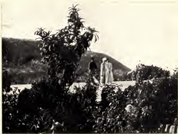
ABDUL BAHÁ WALKING ON THE TERRACE BEFORE THE TOMB OF THE Báb—THE PROMONTORY OF MOUNT CARMEL IS IN THE DISTANCE