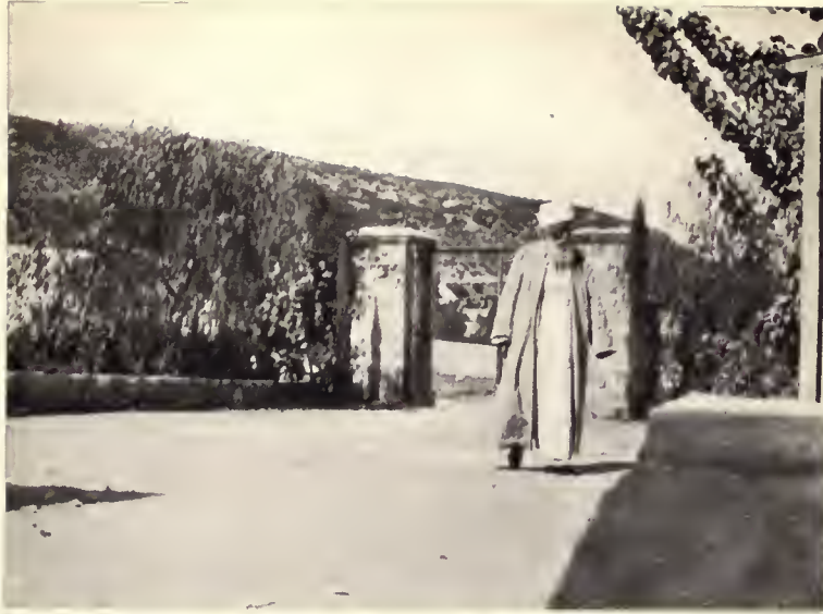
ABDUL BAHÁ ENTERING THE GARDEN OF HIS HOUSE IN HAIFA