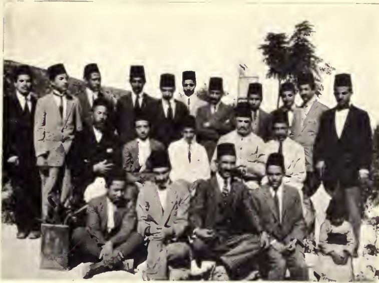
BAHAI STUDENTS ON MOUNT CARMEL