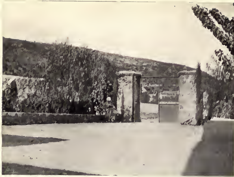
ABDUL BAHA SEATED WRITING WITHIN THE GATEWAY OF HIS HOME IN HAIFA