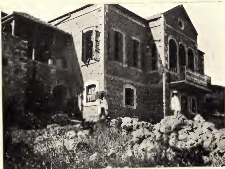
NORTH FRONT OF THE MOZAFER KHANEH