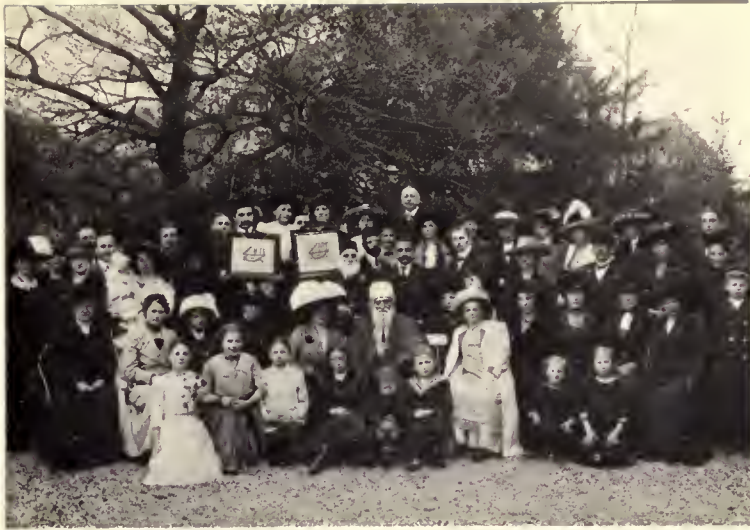
ABDUL BAHA WITH SOME BAHAIS IN STUTTGART