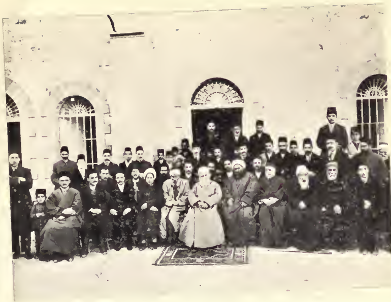
ABDUL BAHA WITH A GROUP OF BAHAIS AT THE TOMB OF THE BAB