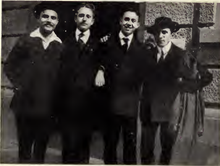
FOUR YOUNG BAHAIS OF ESSLINGEN