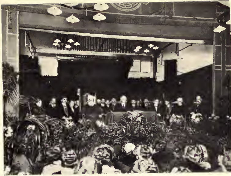
ABDUL BAHA IN A MEETING OF BAHAIS IN LONDON