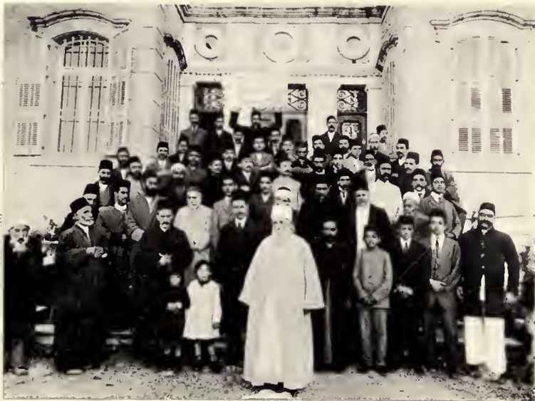
ABDUL BAHA WITH A GROUP OF BELIEVERS AT HIS HOUSE IN HAIFA