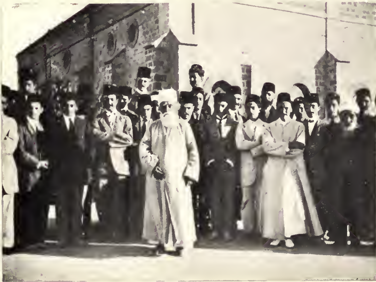
ABDUL BAHA AND A GROUP OF BAHAIS AT THE TOMB OF THE BAB