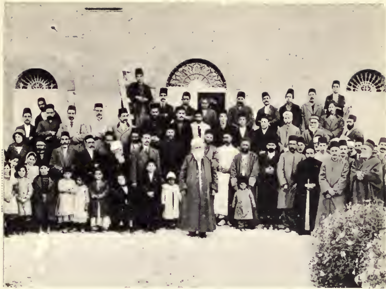
ABDUL BAHA AND A GROUP OF BELIEVERS AT THE TOMB OF THE BAB