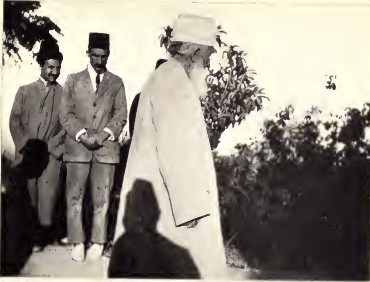
ABDUL BAHA WITH SOME YOUNG MEN ON MOUNT CARMEL