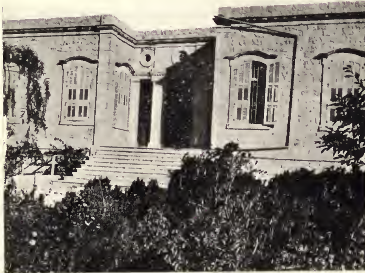
ABDUL BAHÁ'S HOUSE IN HAIFA