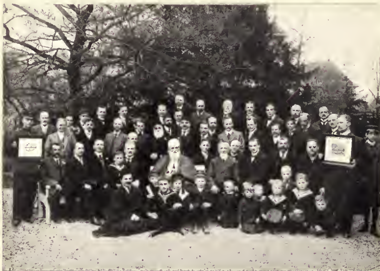
ABDUL BAHA WITH SOME OTHER BAHAIS IN STUTTGART