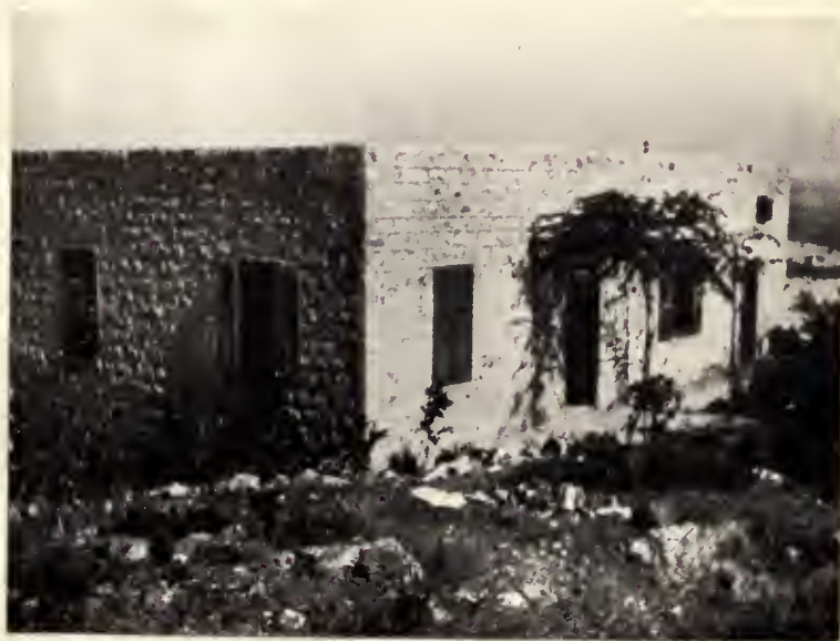
THE HOUSE WHERE ABDUL BAHA OFTEN STAYS ON THE SLOPE OF MOUNT CARMEL