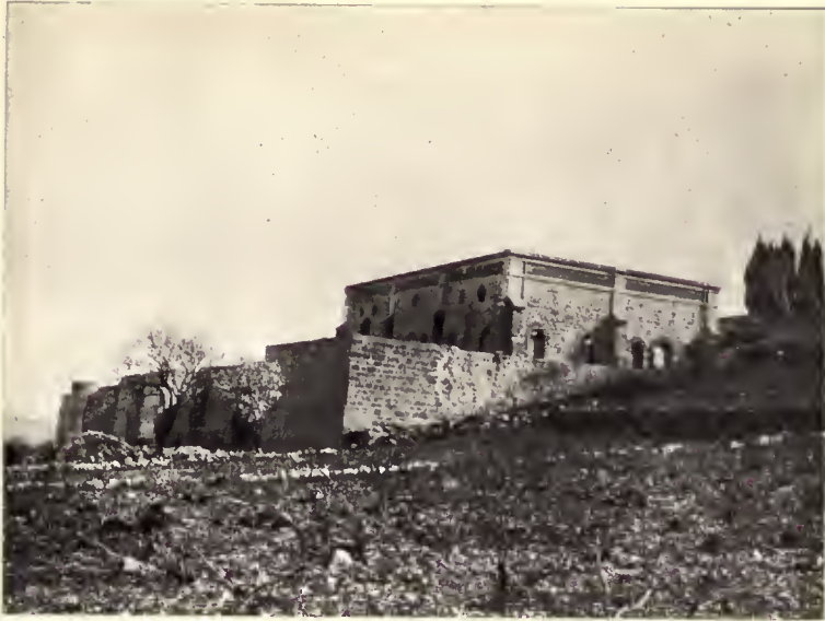
TOMB OF THE BAB ON MOUNT CARMEL