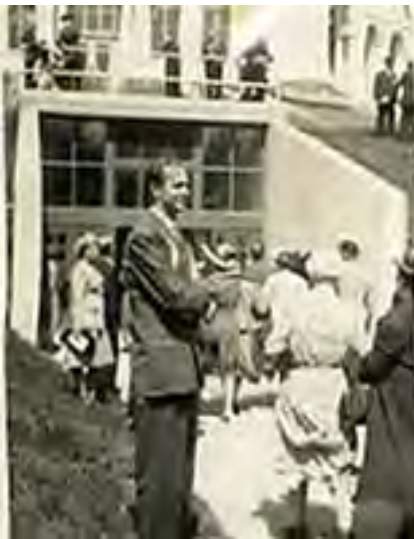
BUD (and me)