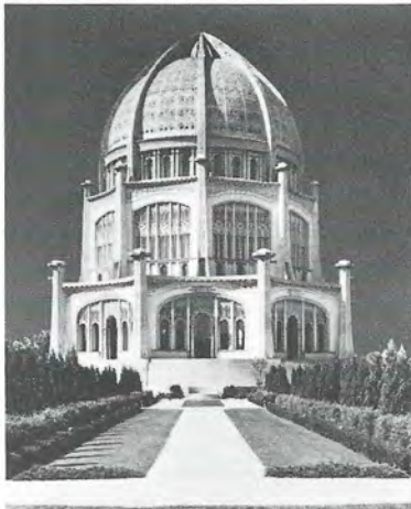
NORTH AMERICA Wilmette, Ill.