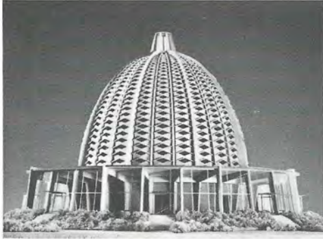
EUROPE Frankfurt, Germany