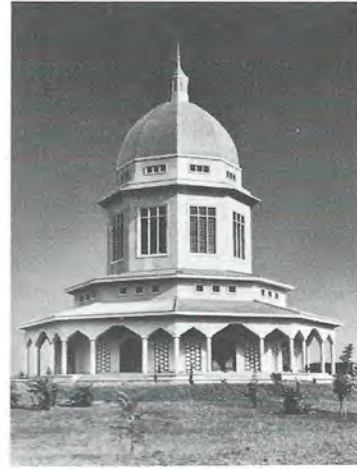
AFRICA Kampala, Uganda