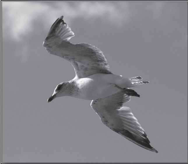
Photograph by Nayyirih G. de Koning-Tahzib